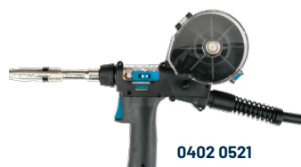
CIGWELD Flame Series BZ24 Spool Gun, 6m with EURO connector

The BlueVenom™ XF353 with the 4R-ROVER are the perfect setup for light to medium fabrication, maintenance and industrial repairs in the workshop, worksite, shipyard, or marina without compromising on quality or professional performance! Use it with the included premium BZ36 MIG Gun or swap it out for a Push-Pull or Spool Gun (each sold separately) for more precise control.